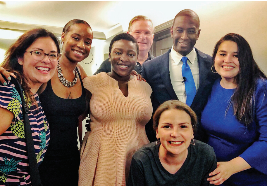
People For the American Way political staff celebrated Next Up-endorsed Florida Democratic gubernatorial candidate Andrew Gillum's primary win at his victory party in Tallahassee, Florida.

You have a lot of work ahead of you. Don't forget why you decided to run in the first place and who got you to where you are now. Let your core values guide your public service. Congratulations!