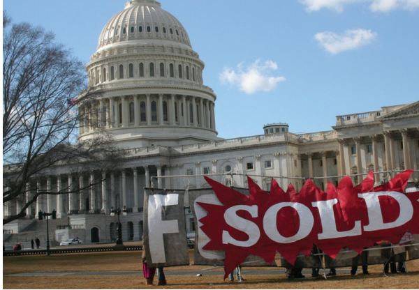
Citizens United Rally 2011

by large entities, like retirement funds, mutual funds, and foundations, which cannot take positions on political races but invest the money of real, live citizens in these corporate and political behemoths.