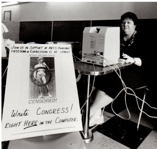
PFAW engaged activists in support for the NEA, generating tens of thousands of calls to members of Congress.

1998: People For organizes "Quiet Walk for the First Amendment" in response to protests led by the Catholic League's Bill Donohue and threats of violence directed against production of the play "Corpus Christi." Among those participating were Norman Lear , playwright Tony Kushner , and actor and writer Wallace Shawn .