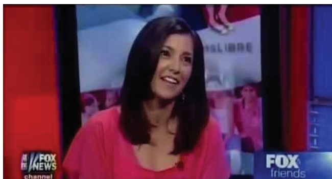
Libre's national spokeswoman Rachel Campos-Duffy has said that, when it comes to Latinos, Republican have a "tonal problem."

These activities have provoked some skepticism. After Sen. Reid pointed out Libre's funding and goals, one Nevada activist told Politico, "A lot of us were already asking questions, because we're all out there in the community, and when a new group shows up and has a lot of money and passes out triple-color T-shirts and throws a grand opening, people start questioning where that money came from."