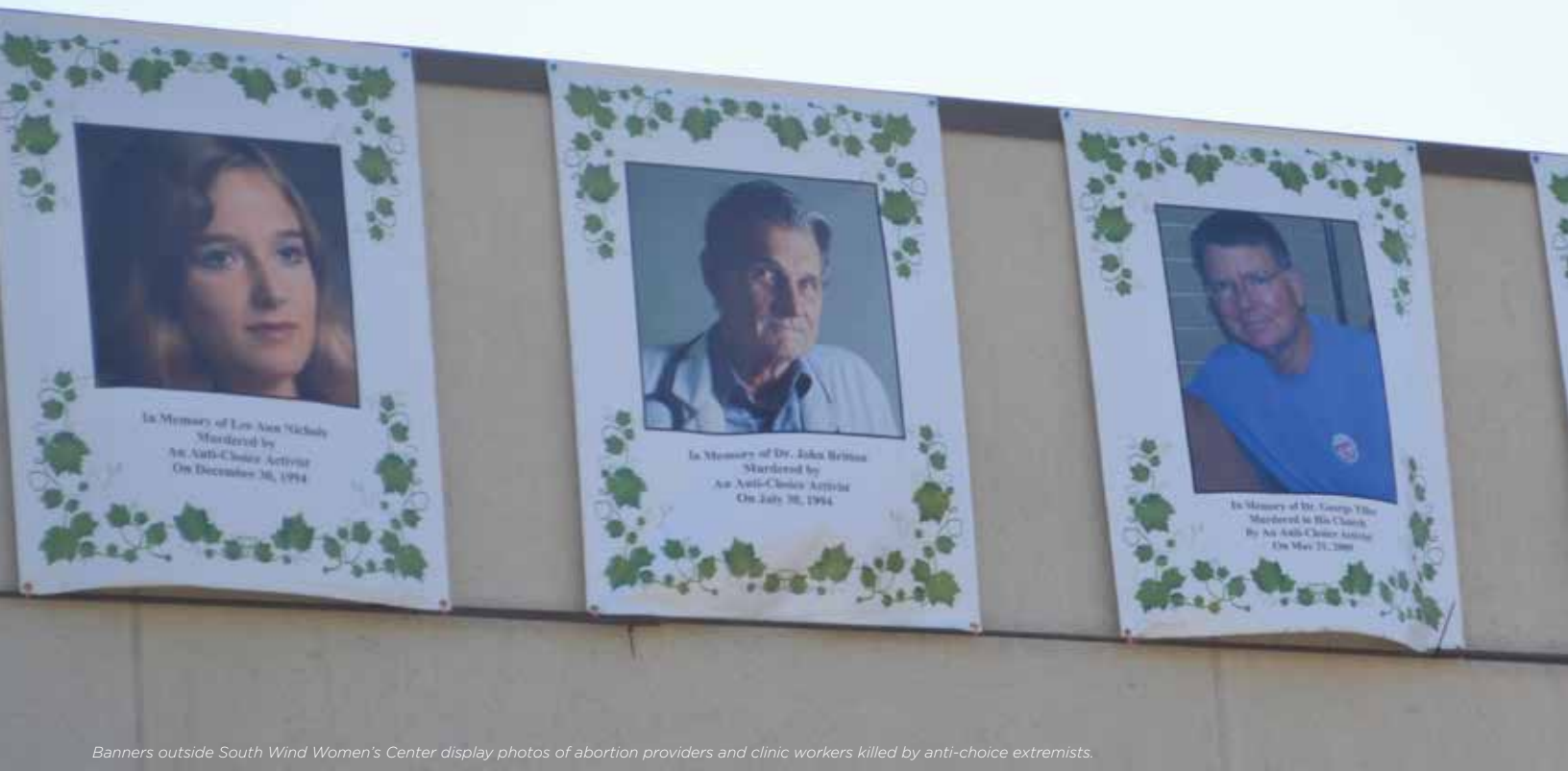
Banners outside South Wind Women's Center display photos of abortion providers and clinic workers killed by anti-choice extremists.

In the summer of 1991, the anti-abortion protest group Operation Rescue led a siege of Wichita, Kansas, which made national news and galvanized both sides of the abortion debate. Sometimes by hundreds at a time, protesters physically blocked the doors of Wichita's three abortion clinics, focusing special attention on the clinic led by Dr. George Tiller, one of the few doctors in the country to offer late-term abortions. The "Summer of Mercy" was meant to last one week; it ended up lasting nearly seven. By the end of it, 1,781 anti-abortion activists had been arrested, many multiple times. The governor of Kansas supported the protesters, and President George H.W. Bush's Justice Department stepped in on their behalf. The summer ended with a rally that attracted 25,000 people and featured Christian Coalition leader Pat Robertson.