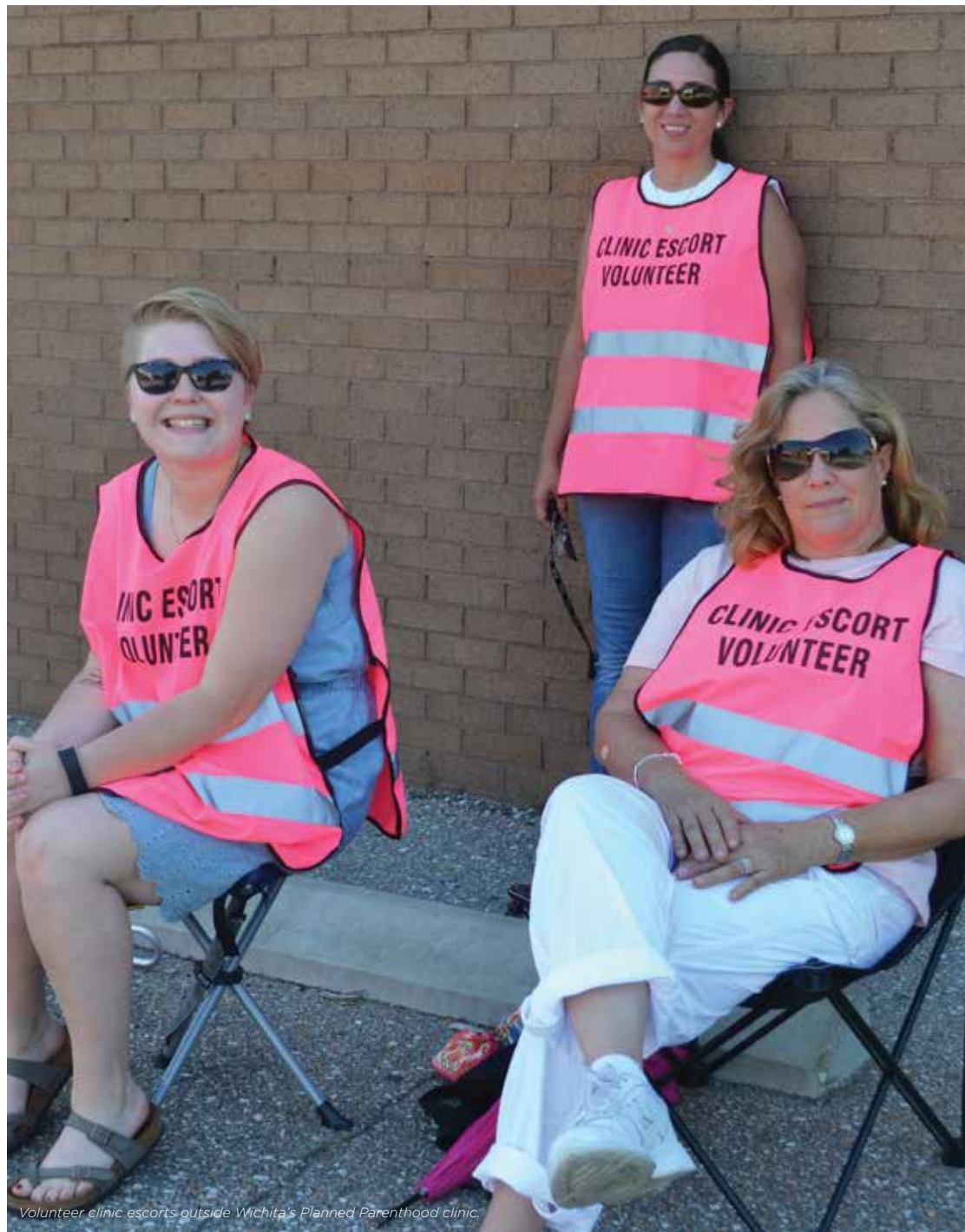
Volunteer clinic escorts outside Wichita's Planned Parenthood clinic.