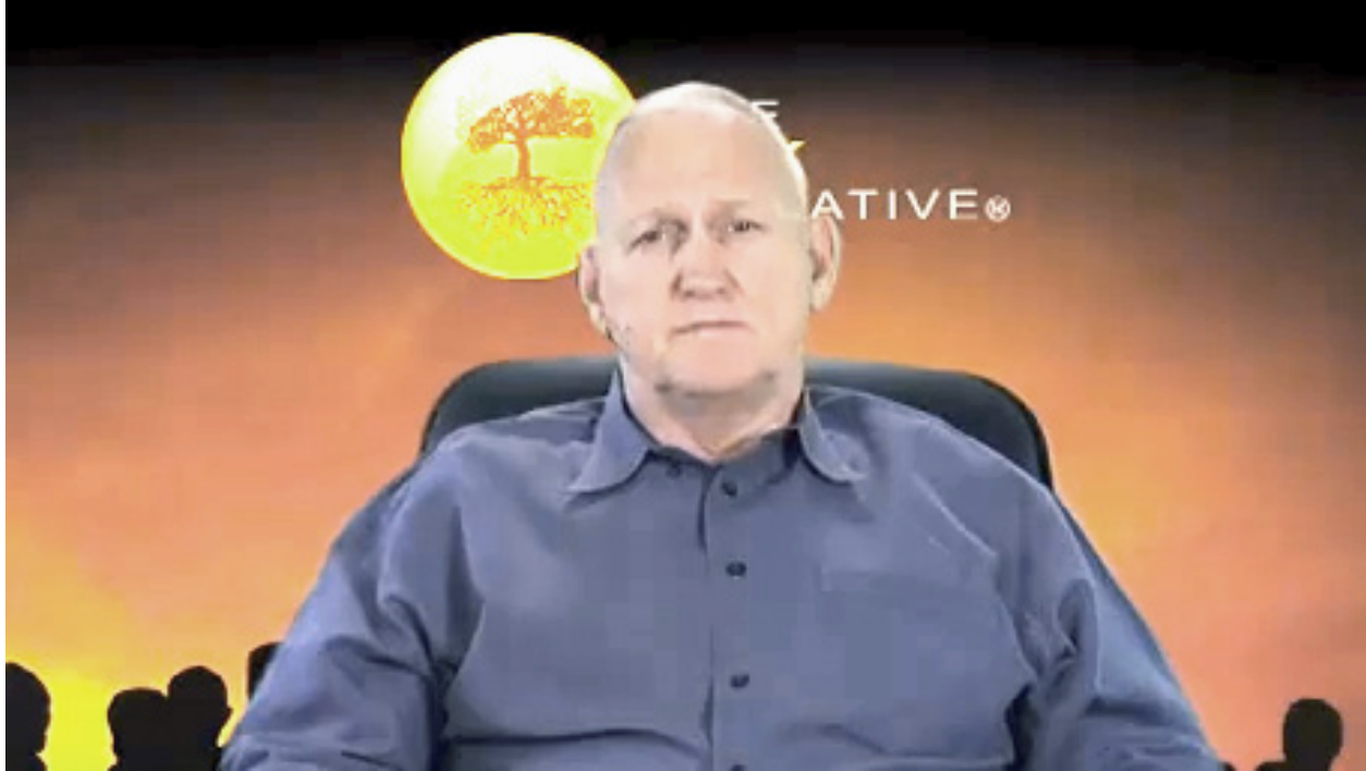
Jerry Boykin, The Oak Initiative Board Member