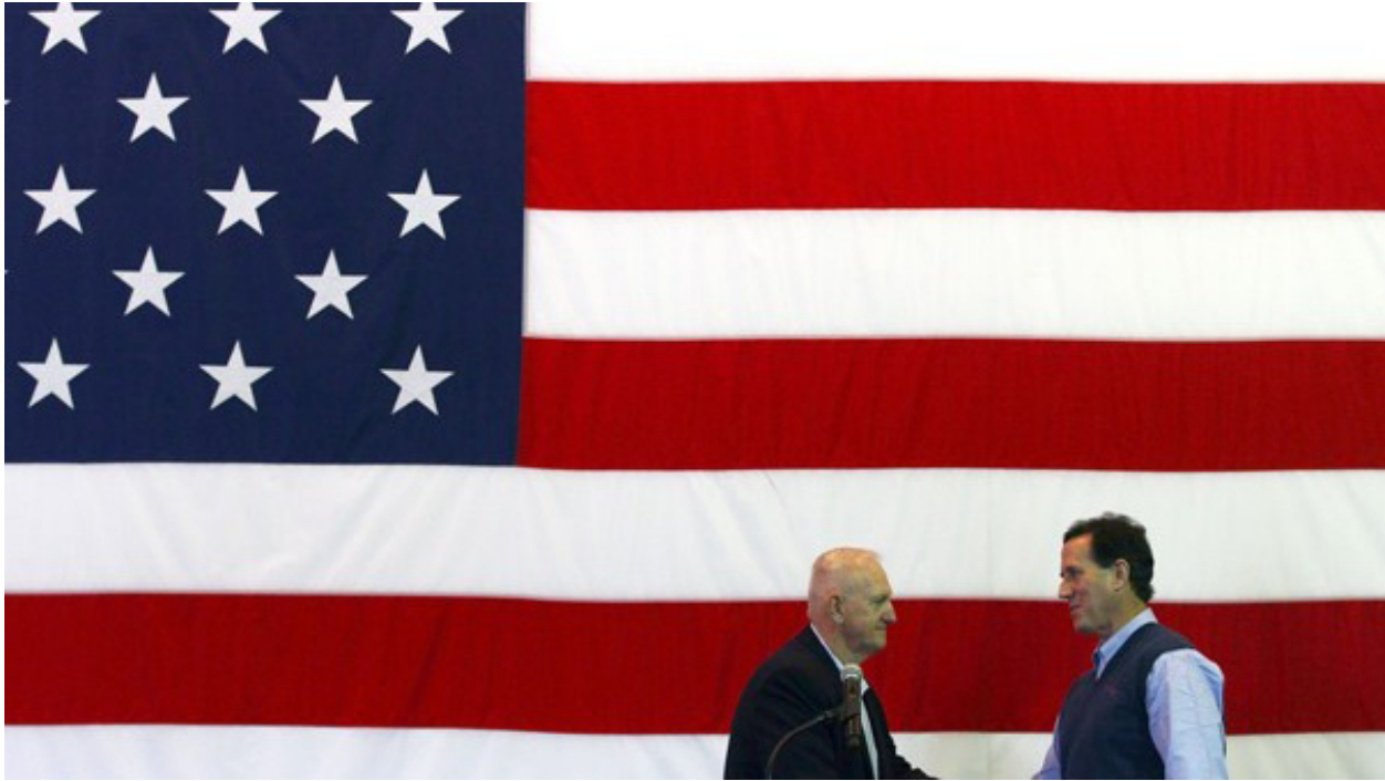
CHARLESTON, SC - JANUARY 17: Republican presidential candidate, and former U.S. Sen. Rick Santorum (R), is introduced by Gen. William Boykin Ret. during a campaign rally aboard the U.S.S. Yorktown on January 17, 2012 in Charleston, South Carolina.